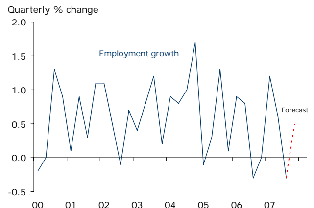
Volatile employment growth

The September quarter survey threw up a puzzling fall in employment along with a lower unemployment rate, caused by a sharp fall in the female participation rate. Quarter on quarter, the HLFS has been notable for volatile outcomes over the past five years with a standard deviation of 0.6 percent for employment growth.