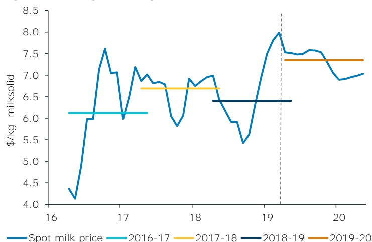
Figure 1: Farmgate milk prices, historic and forecast

The exchange rate used in our forecast calculation takes into account Fonterra's assumed hedging policy , which implies a delay in the impact of movements of the NZD on the farmgate milk price. The effective exchange rate used in the forecasts is USD0.665. The 2019/20 forecast is based on a weighted whole milk powder (WMP) price of USD3140/t for next season. This is slightly below the price at which WMP is currently trading.