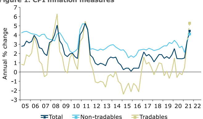
Figure 1. CPI inflation measures