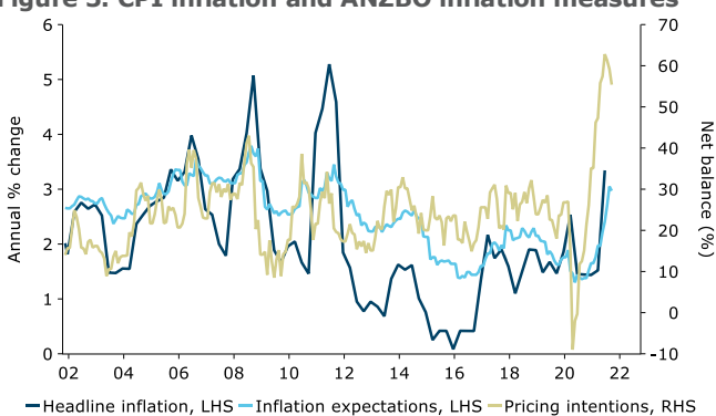
Figure 3. CPI inflation and ANZBO inflation measures