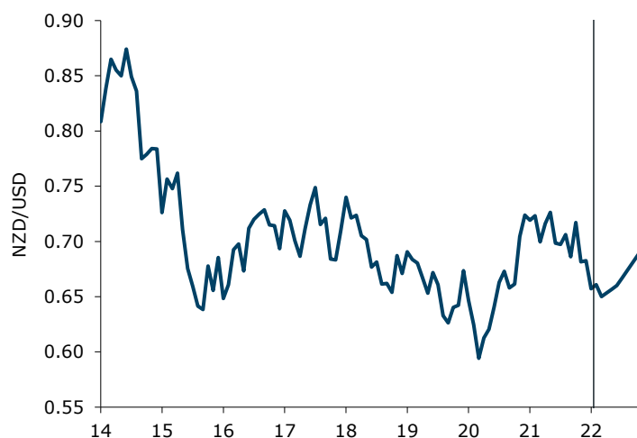
Figure 3. NZD/USD

We anticipate a gradual increase in the NZD across the forecast period. The NZ dollar has remained very subdued and hasn't strengthened in response to the RBNZ starting to tighten monetary policy. Most central banks around the globe are now poised to commence monetary policy tightening, so it is not just New Zealand that is experiencing rising interest rates. If New Zealand's interest rates are higher than other countries then we tend to attract more money flowing into New Zealand which puts upward pressure on our exchange rate. We now anticipate the NZD will gradually firm to USD0.70 by December 2022