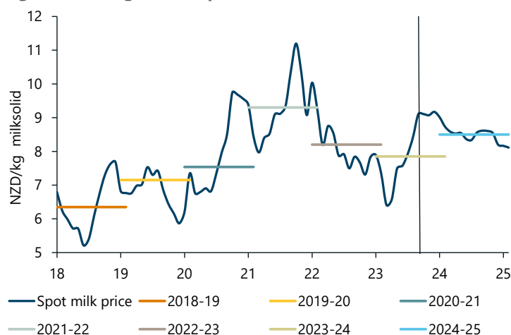
Figure 1. Farmgate milk prices