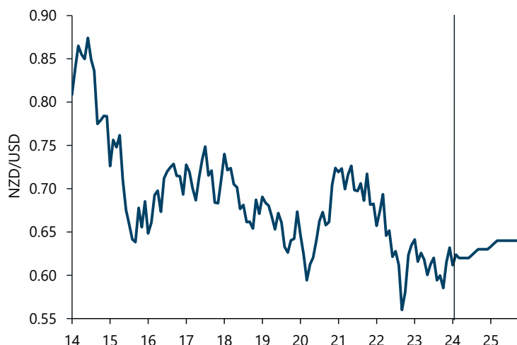
Figure 3. NZD/USD

We are forecasting the NZD to increase only slightly throughout the forecast horizon, reaching USD0.63 by December 2024, then trending up to USD0.64 in 2025. The relatively low NZD has helped support the farmgate milk price.