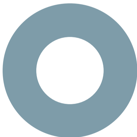
Other (listed infrastructure) 100.00%

This shows the types of assets that the fund invests in.