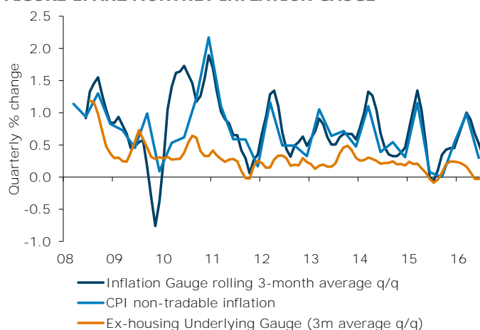
FIGURE 1: ANZ MONTHLY INFLATION GAUGE

The largest positive contribution came from postal services. Purchase of housing costs continued to lift, though at a slower rate than seen over prior months.