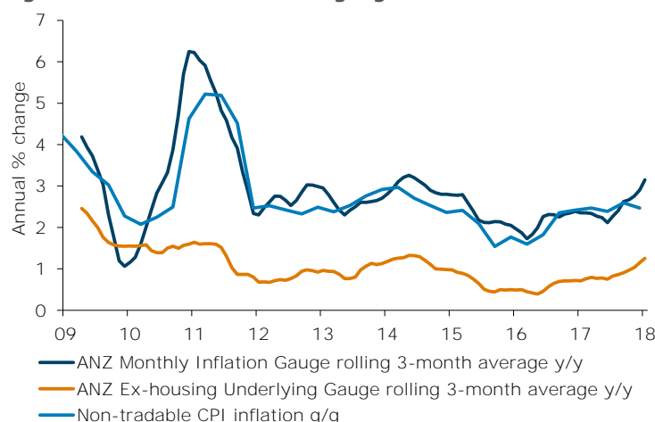
Figure 1: Annual ANZ inflation gauges and non-tradable inflation

The path of inflation from here is far from clear. Although one-offs played a big part, this month's Gauge gives us reason to keep a close watch for whether momentum continues through the rest of Q1. It'll be a tough grind with a wobbly economic growth outlook in the near term, but we do see a degree of upside risk to wages and thus firms' costs.